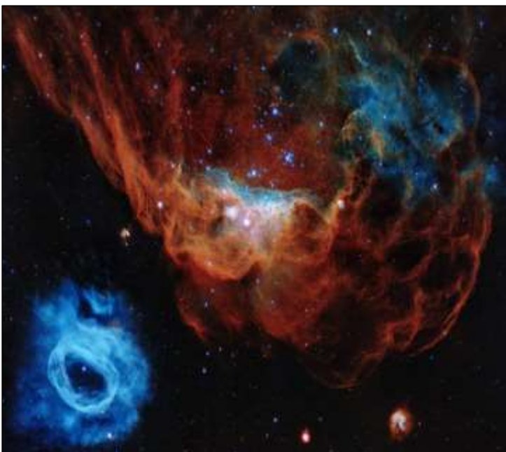
Pictured: The anniversary image, taken from Hubbles Twitter page, featuring the giant nebula NGC 2014 and its neighbour NGC 2020, part of a vast star-forming region in the Large Magellanic Cloud.

The Hubble telescope celebrated 30 years since it was launched by releasing an amazing image, the picture of nebulas NGC 2014 and NGC 2020 has been nicknamed the "Cosmic Reef" because it looks like an undersea world. Nebulas NGC 2014 and NGC 2020 are part of the Large Magellanic Cloud, a satellite galaxy of the Milky Way, around 163,000 light-years away. The giant telescope was sent into low Earth orbit in April 1990 to capture images and data of distant galaxies, planets and supermassive black holes, deep within our universe. The information gathered has been used to write thousands of scientific papers. You can see what the Hubble telescope saw on your birthday by adding your birth month and day at https://imagine.gsfc.nasa.gov/hst_bday/ you will then be shown the best photo captured on that date within the last three decades!