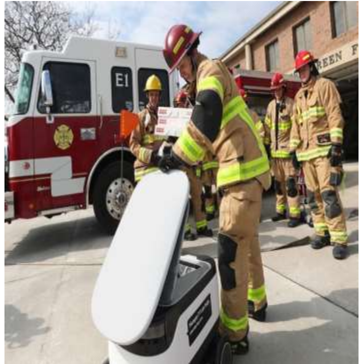
Pictured: The Starship technologies food delivery robot delivering food to firefighters in Kentucky, America taken from their Twitter page.

NHS workers in Milton Keynes are having their shopping delivered by robots! The NHS staff, who sometimes cannot visit the shops themselves due to the long hours that they are working, are now getting free deliveries from robots. The Starship Technologies food delivery robots can hold several bags of shopping and a crate of bottles. They travel on the pavements around the town at up to 4 miles per hour. Starship who have a fleet of 70 machines, have been operating in Milton Keynes since 2018, say that 100,000 autonomous deliveries have now been completed in the town. "Right now, we are offering free delivery to all NHS workers within the community. We want to make life a little bit easier for these people in these very, very stressful times," said Henry Harris-Burland of Starship.