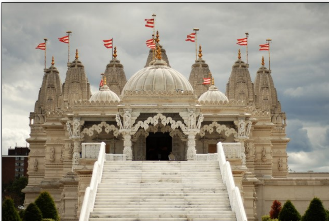
A picture of a Mandir

It is important for Hindus to go on a pilgrimage to the River Ganges in India. They believe washing in the river cleanses them of their sins.