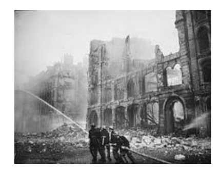
London during the Blitz