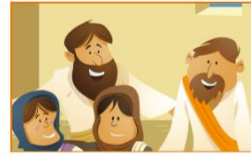
Luke 8: 38-41