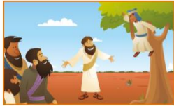
Luke 19: 1-9

We are learning to identify when it is easy and difficult to show friendship and explore when Jesus may have found it difficult. We are looking at 3 stories from the New Testament: Zacchaeus, Stilling the storm, and Mary, Martha and Lazarus