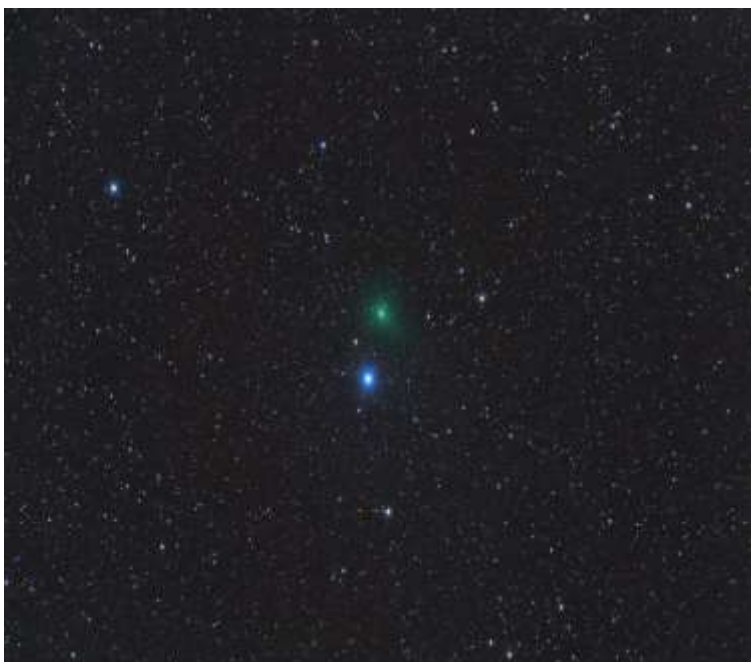
Pictured: Another bright comet, Comet C/2017 O1 (ASASSN) taken by CajunAstro on Oct 29, 2017.

A comet called Atlas is on its way towards Earth and could appear as bright as a crescent moon. Comets are icy bodies in space that release gas or dust. This comet was discovered in December in the area of Ursa Major, which is a constellation in the northern sky also known as the Great Bear. The comet was discovered by the Asteroid Terrestrial-impact Last Alert system (ATLAS) in Hawaii and takes its name from the initials of the system. It is an asteroid detection system that will patrol the visible sky twice a night looking for smaller objects moving through space. Unless it breaks up from the Sun's heat first, Comet ATLAS will reach a perihelion (closest approach to the Sun) on 31 st May, inside the orbit of Mercury, with the possibility of becoming a naked-eye comet.